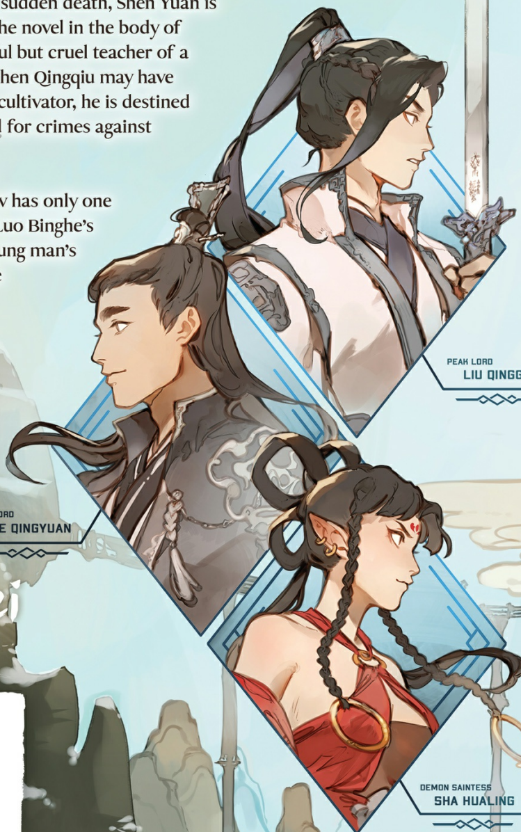
PEAK LORD LIU QINGGE

The new Shen Qingqiu now has only one course of action: get into Luo Binghe's good graces before the young man's rise to power or suffer the awful fate of a true scum villain!